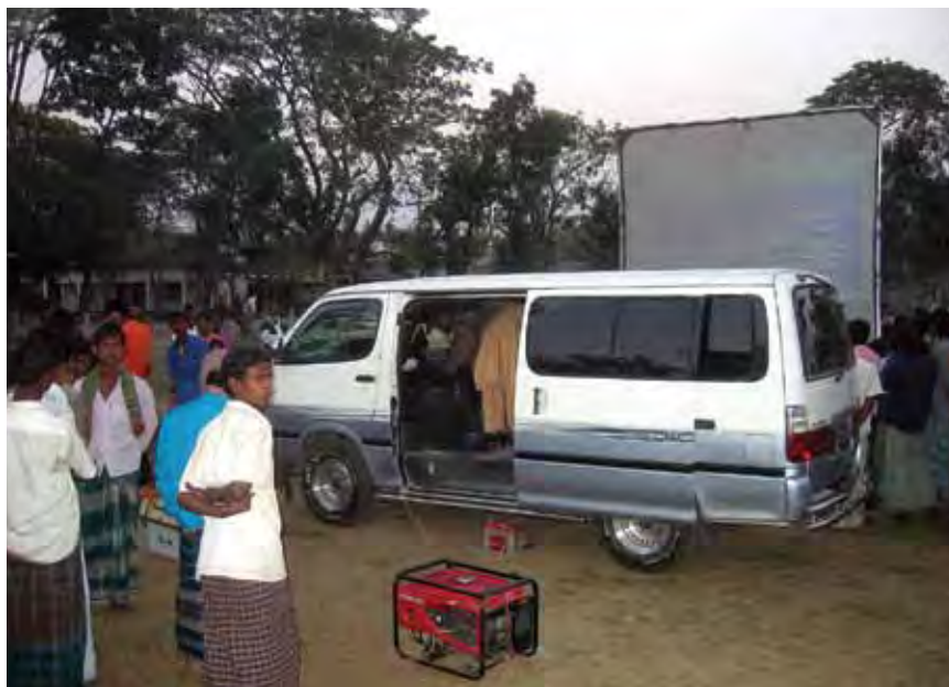
Setting up the mobile cinema in a Bangladeshi village.